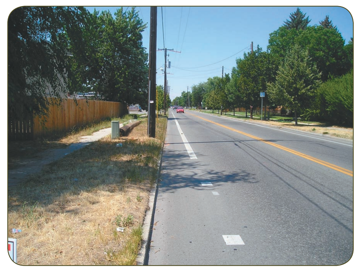
Boise Avenue, Boise