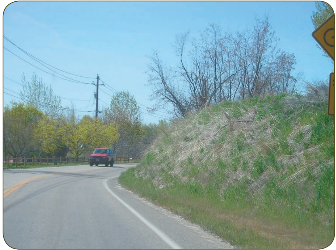
Hill Road, Boise

Bicycle Lanes: Designated exclusively for bicycle travel, bicycle lanes are separated from vehicle travel lanes with striping and