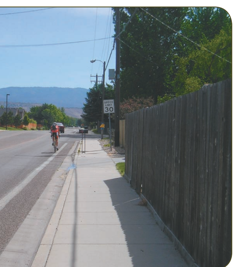
Marigold Street, Garden City