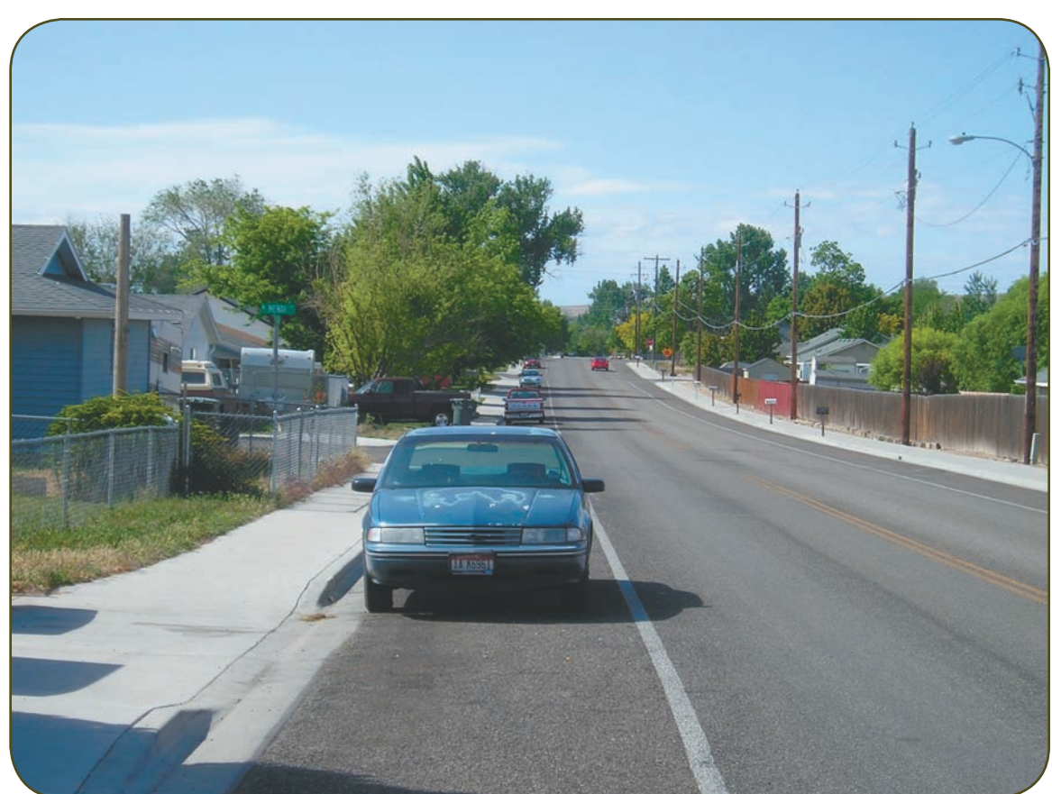
School Street, Kuna