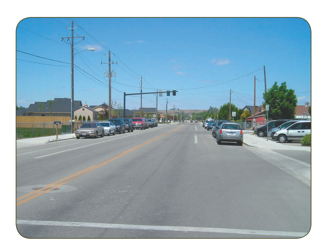
Star Road, Star