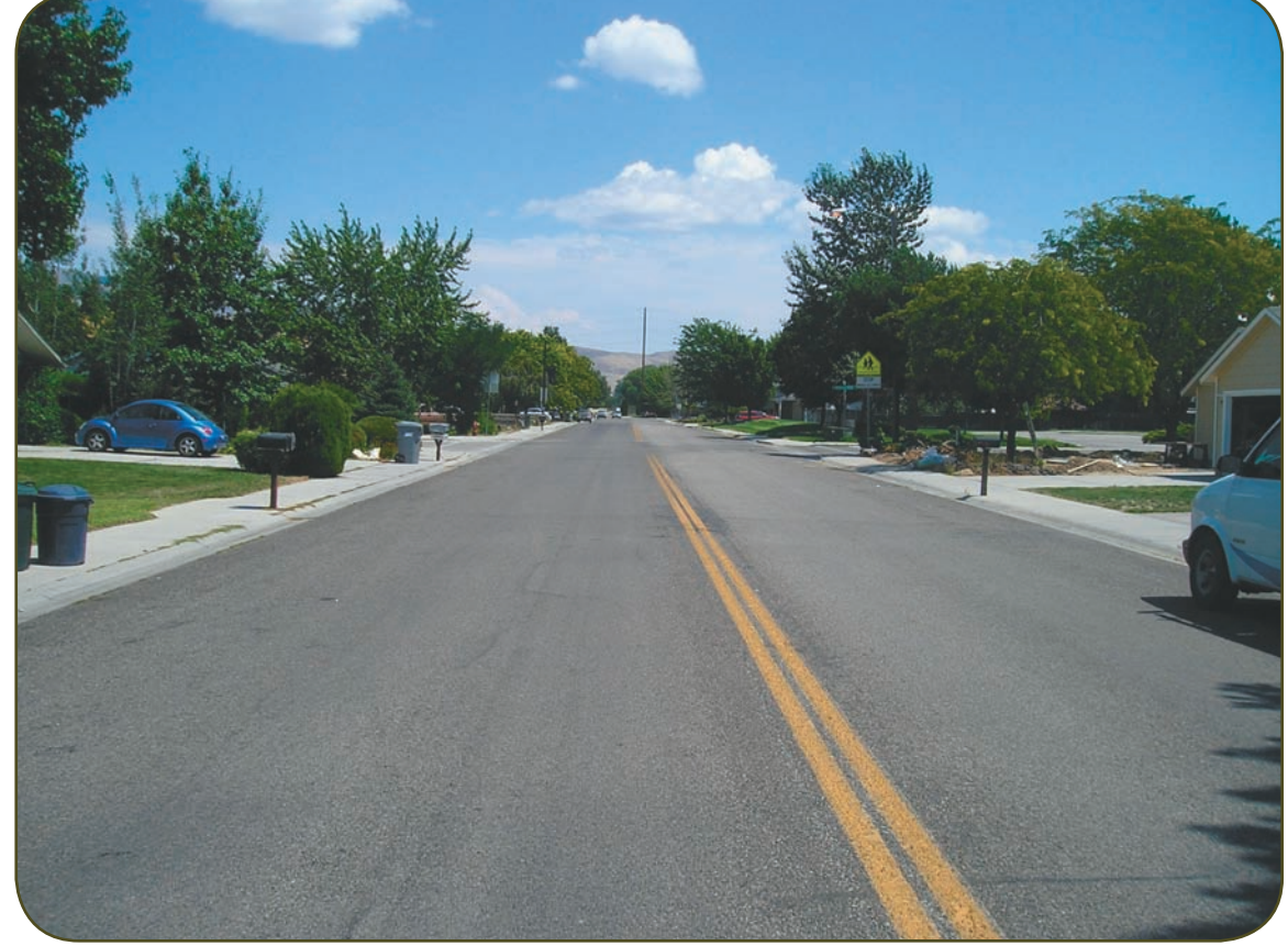
Bergeson Street, Boise

Signed Shared Bikeway (formerly Bike Routes): Signed Shared Bikeways are on roadways that accommodate vehicles and bicycles in the same travel lane. The most suitable roadways for shared vehicle/bicycle use are those with low posted speeds (25) MPH or less) or low traffic volumes (3,000 daily vehicle trips or less).