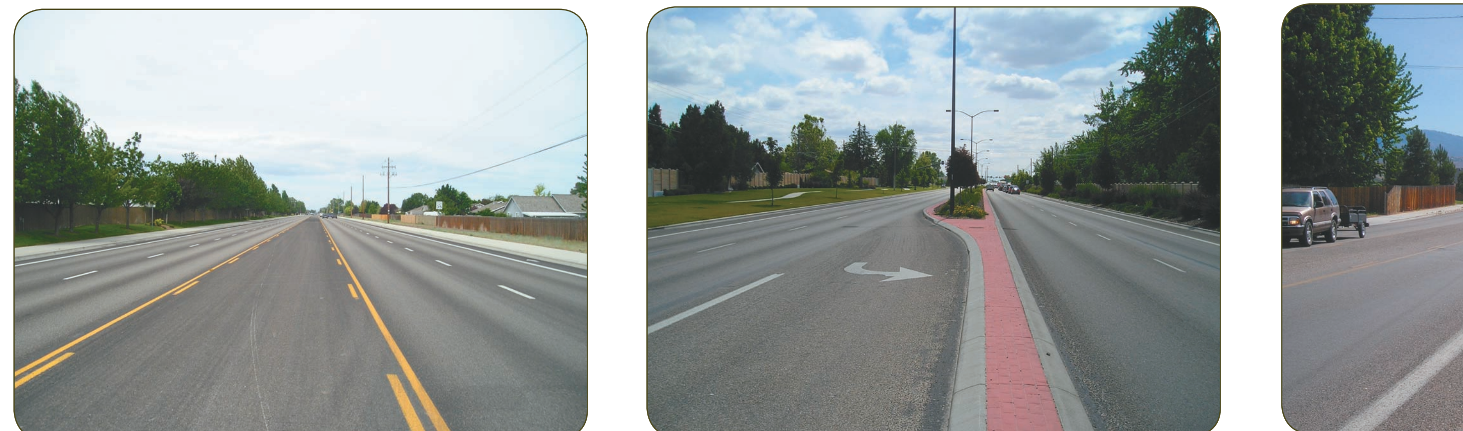
Cherry Lane, Meridian

Multi-Use Paths: Multi-use paths (Pathways) are used by various non-motorized users, including pedestrians, cyclists, in-line skaters, and runners, and have their own right-of-way separated from the roadway. This plan will look at connections to multi-use paths, but does not address them directly, as they are the responsibility of the county and cities' parks and recreation departments on public land, and private development/HOA within other subdivisions. alta Parametrix